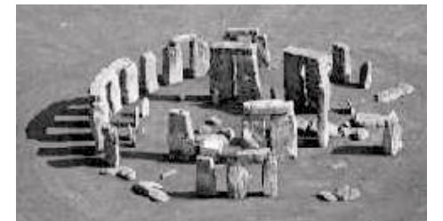
The famous and mysterious Stonehenge, photographed from above