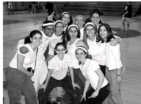
Enthusiastic Juniors strike a pose before the games begin

From the beginning the sopohmores were completely outnumbered by everybody. But they worked just that much