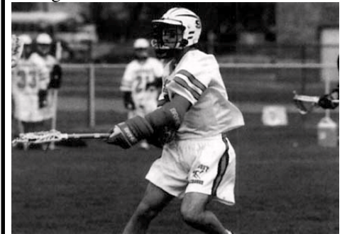
A Braves Lacrosse player in action

The season looks to be a promising one. The teams have had success in the pre-season, and look to continue this success throughout the season.