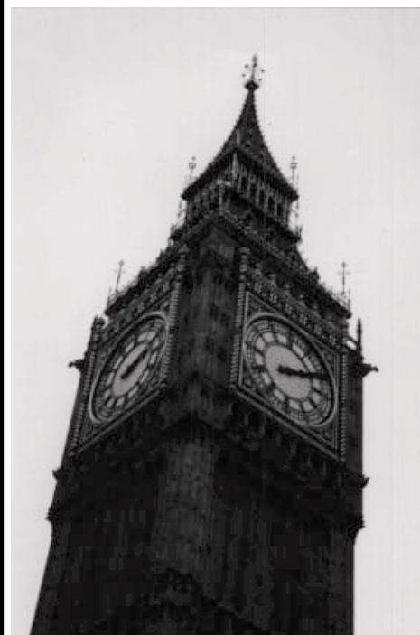
Big Ben Up Close and Personal