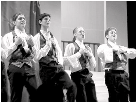
The dancing waiters scene was a hit with the crowd. Everybody loved the crazy antics of this talented bunch.

There was a great deal of adrenaline in the air as the curtains opened on Wednesday March 24, 1999 for the opening perfor-