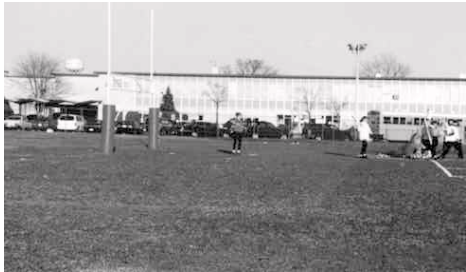
Lady Braves Lacrosse players gear up for the game

After a disappointing season last year, the members of the Syosset Girls Varsity Lacrosse team have vowed to make up for last year's season. In the newly formed Conference I-B, the girls no longer face rivals Port Washington,